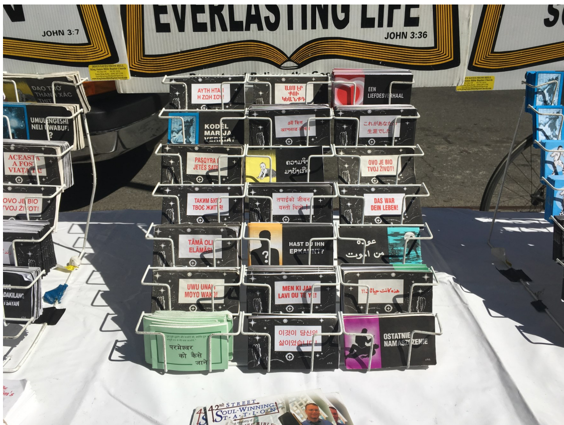
It's fun to hand someone a tract in their native language

That is the mission I have in my heart: to preach the gospel. I enjoy doing it. I love to do it. I believe to be unworthy, but God can use even the biggest fools in the world to serve him. I just love the Lord Jesus Christ so much, for saving my soul from hell. I could have died and gone to hell, but God had so much grace and mercy to save me from hellfire.