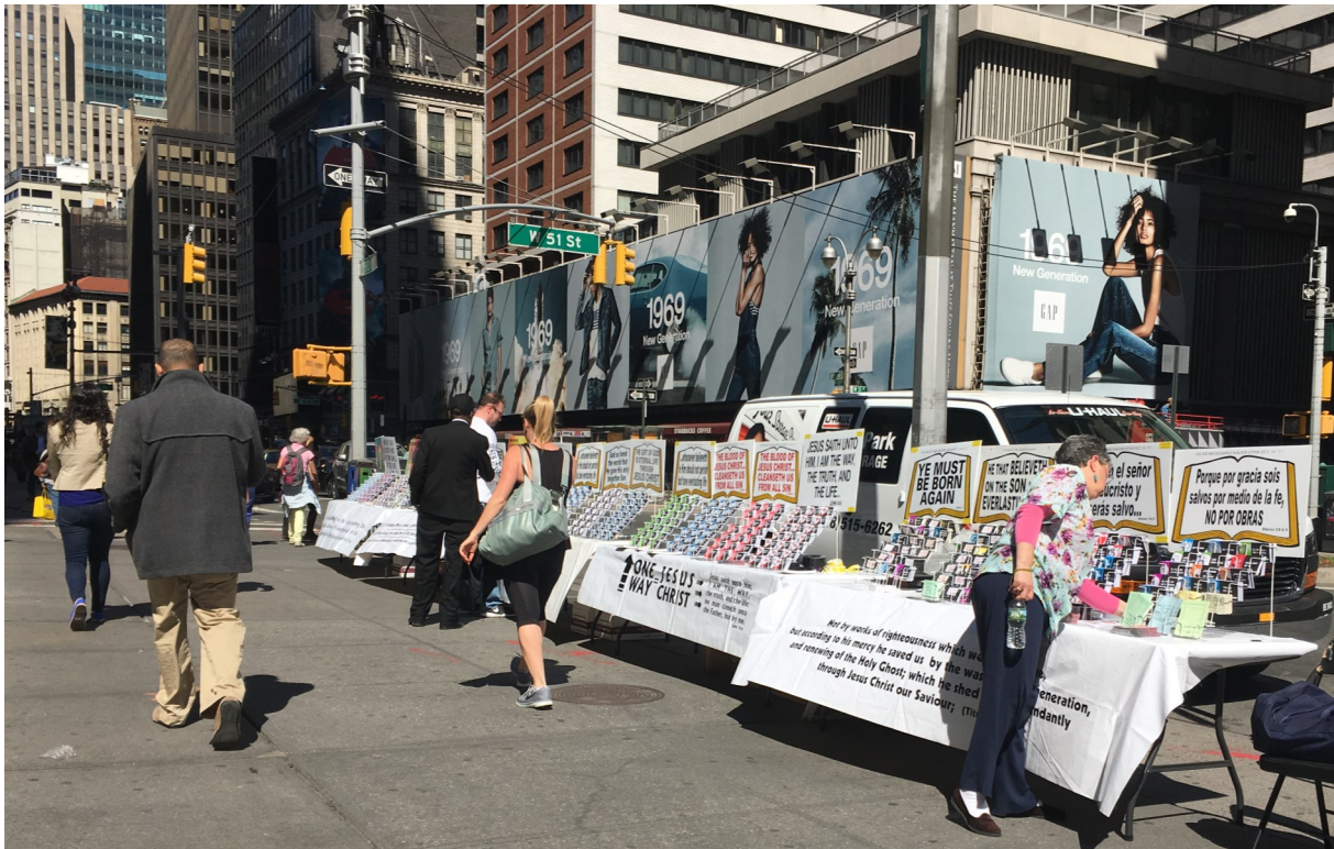
Times Square is big and grand, therefore we must be grand as well.